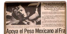
On Kawara, 5 JUN.68, E.U. El senador Robert F. Kennedy..., 1968, Liquitex on canvas